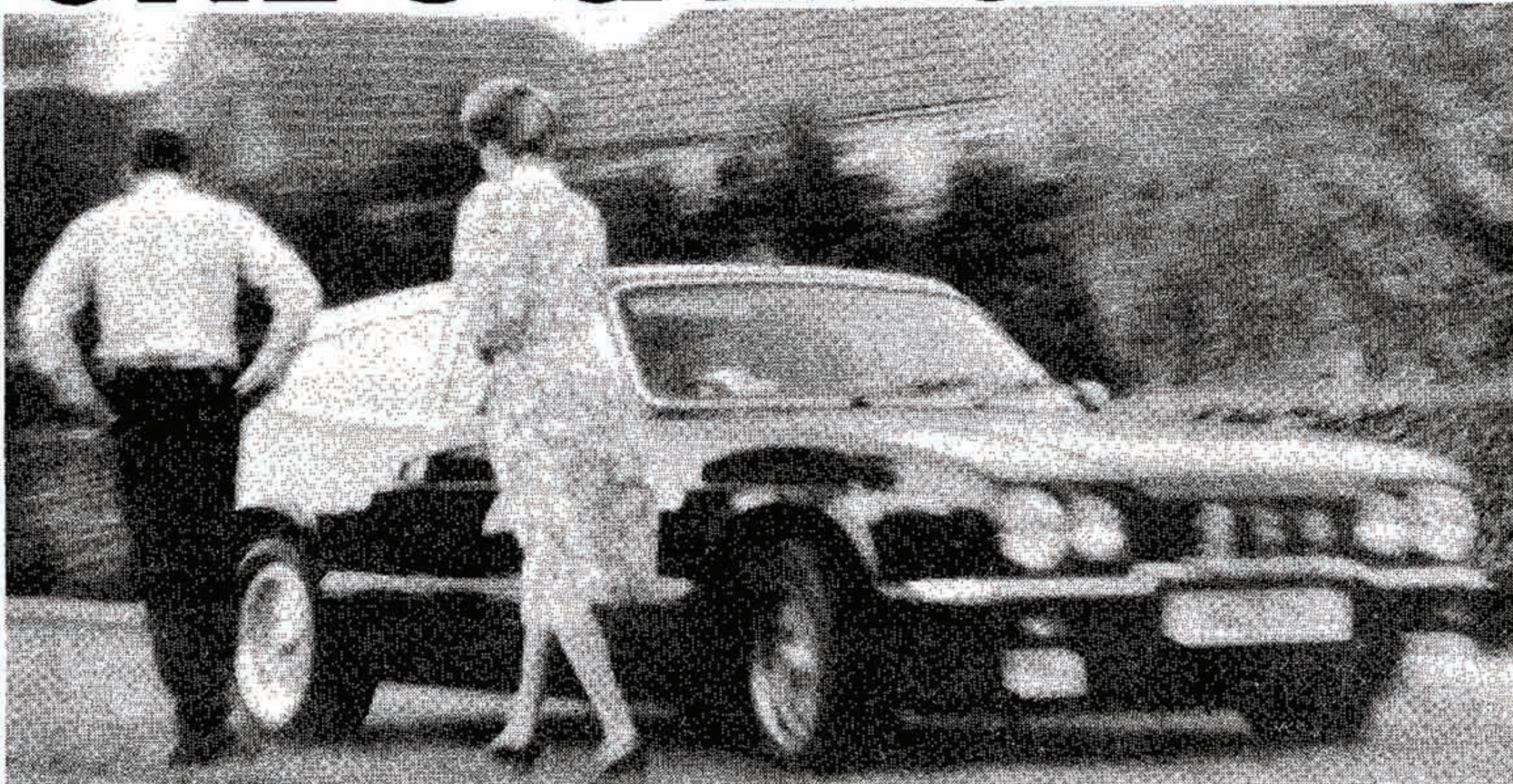
The Princess oil . . . smartly-dressed Anne and her minder inspect the broken down Scimitar, before she has a go at fixing it

PRACTICAL Princess Anne gave other motorists a surprise when her car broke down — by rolling up her sleeves and pushing it!